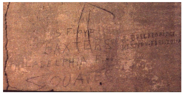
Signatures of members of Co. G, Baxter's Zouaves, Roeder's Store, Harpers Ferry.

Howard's 2<sup>nd</sup> Brigade, known as the Philadelphia Brigade. Moving through the West Woods during the morning phase of the battle, the enfilade of McLaws' Confederates devastated the Brigade. Although the Philadelphia Brigade, made up of only four Pennsylvania regiments, had the highest number of casualties resulting from the Antietam