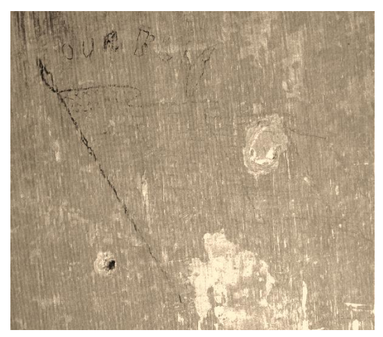
Drawing of the American flag.