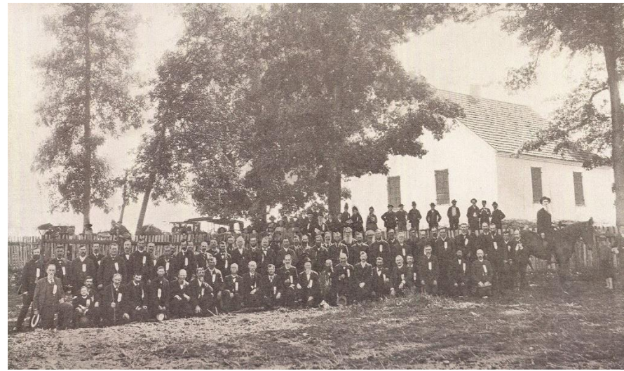
125th Pennsylvania reunion at the Dunker Church, 1888.

Remarkably, the Antietam Battlefield changed little in the decades after the war. Despite the fact that the land remained in private ownership, the region's robust agricultural economy helped to preserve the farms and the Sharpsburg community much as it had appeared during the 1860s. The Dunker Church that stood at the center of the bloody battle, also remained little changed through the nineteenth century. Standing alone at the edge of the West Woods, the little church was perhaps the most recognizable landmark from the battle for returning veterans.