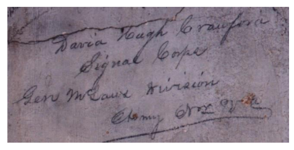
remain largely shrouded in mystery; Signatures in Linden Hall. however, an 1888 article in the Southern Historical Society Papers described its organization: